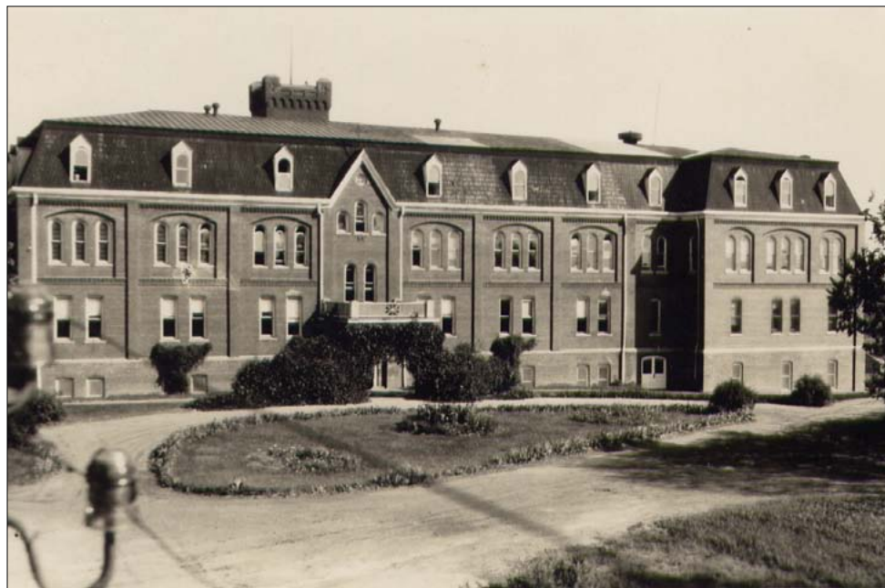
CONCEPTION SEMINARY COLLEGE WAS ESTABLISHED IN 1886 BY THE MONKS OF CONCEPTION ABBEY.